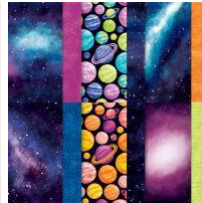
Stargazing 12" X 12"