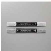
Smoky Slate Stampin'