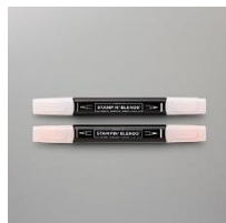
Petal Pink Stampin'