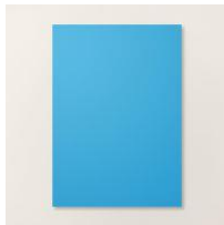
Azure Afternoon A4