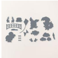
Playing In The Rain