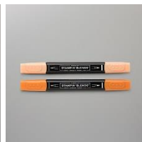
Pumpkin Pie Stampin'