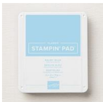
Balmy Blue Classic