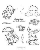
Playing In The Rain